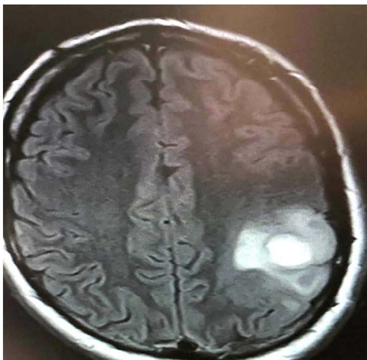
Fig. 1. MRI of a supratentorial primary tumor of the frontal localization on the left

In all patients, primary supratentorial intracerebral tumors of the frontal, temporal and parietal localization were diagnosed and verified by magnetic resonance or computer tomography (Fig. 1). The histological structure of the tumors was verified by examination of the surgical material.