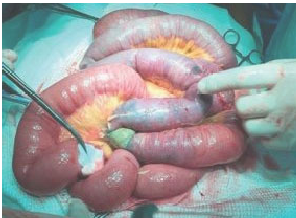
Fig. 3. Diagnostic laparotomy, patient M., 69 y.o.

vascular surgery. An important role is played by early relaparotomy in patients who underwent interventions for acute mesenteric thrombosis, with increasing necrotic changes in the intestinal wall. Relaparotomy should be performed not earlier than 8-10 hours after the initial surgery.