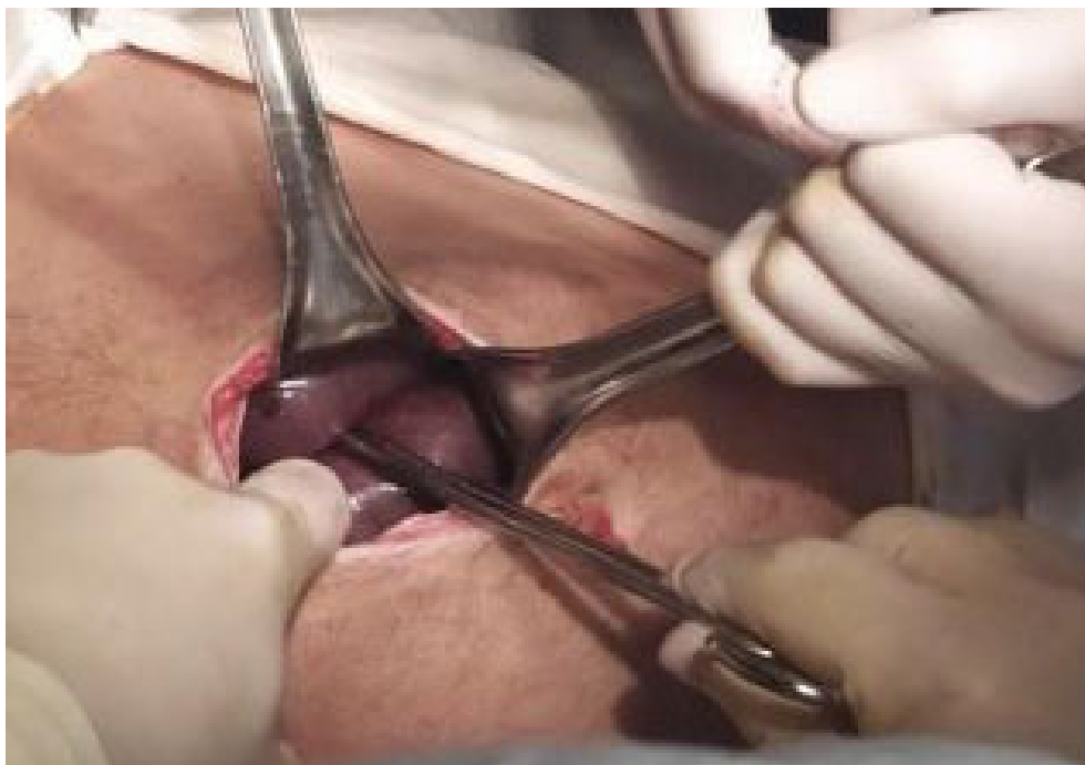
Fig. 2. Diagnostic mini-laparotomy in mesenteric thrombosis of the first segment of the superior mesenteric artery in patient M., 53 y.o. with COVID-19

At the stage of intestinal ischemia, vascular surgeries have been performed. At the infarction stage – vascular surgery in combination with intestinal resection or intestinal resection only.